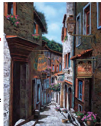
The art of successful fundraising since 1969

St. Francis of Assisi Parish is sponsoring an Art Auction featuring art in all media and price ranges on Saturday, November 16th, 2019 in the Parish Center . The preview will be at 6:30 p.m. with the auction to begin at 7:30 p.m. Admission is $15.00 per person . Hors d'oeuvres, dessert, and beverages will be served. There will also be a cash bar. Following the auction, there will be a next day sale on Sunday, November 17th, from 8:30 a.m.—1:30 p.m. For Tickets or more information, please call 703-221-3868 . Major credit cards accepted.