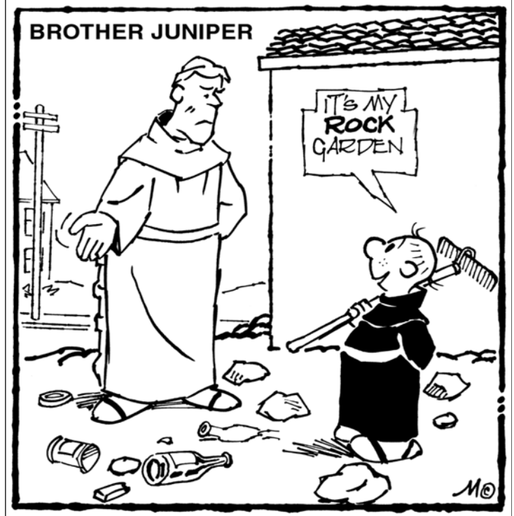
A fresh perspective on the Sunday Readings